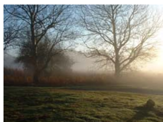
Misty morning – view over the heath from the kitchen

of Thorpeness, just Aldeburgh has the artificial lake for punting and you may "House in the Clouds" to the south and